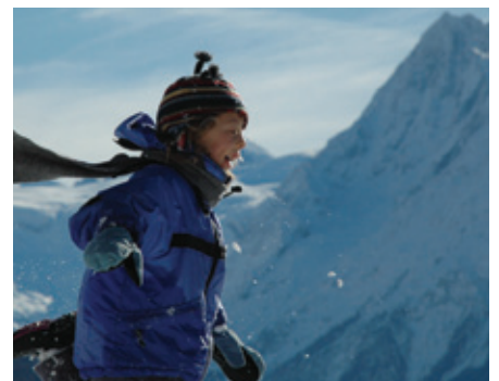
ALPHEE OF THE STARS