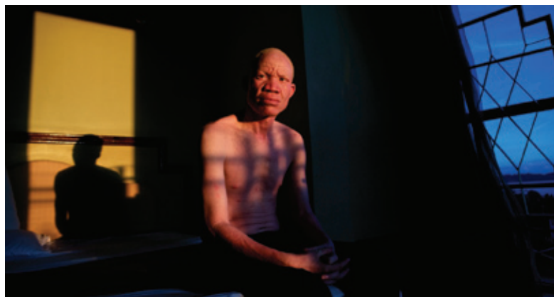
IN THE SHADOW OF THE SUN