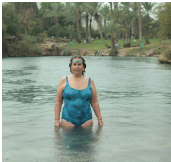
THE GARDEN OF EDEN