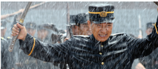
THE GREAT NORTH KOREAN PICTURE SHOW