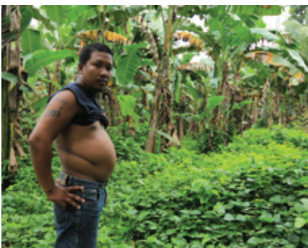
TALES FROM THE ORGAN TRADE