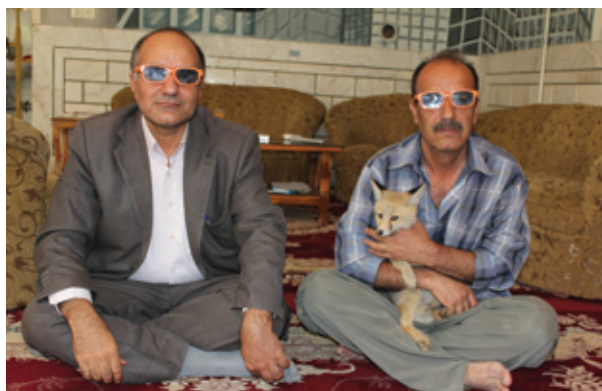
TRUCKER AND THE FOX