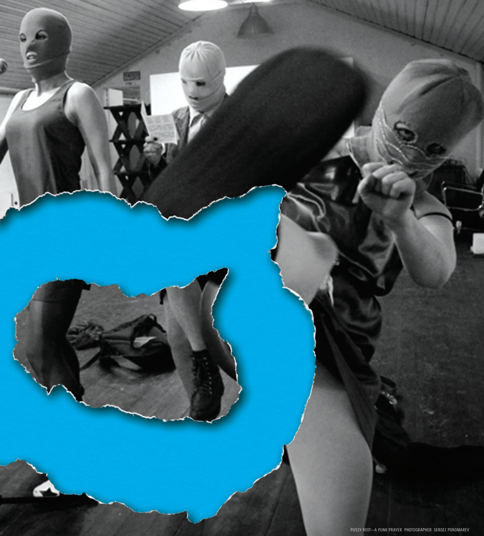
PUSSY RIOT—A PUNK PRAYER