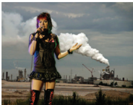
OIL SANDS KARAOKE