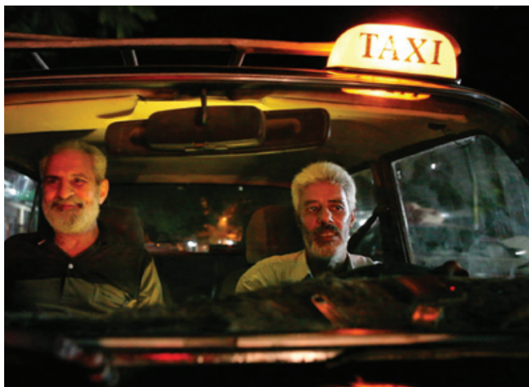
ANOTHER NIGHT ON EARTH