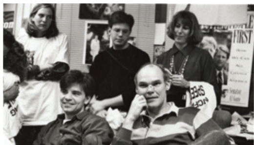
THE WAR ROOM