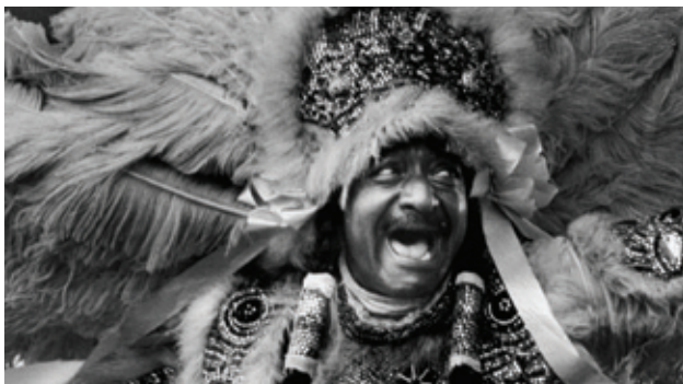
ALWAYS FOR PLEASURE