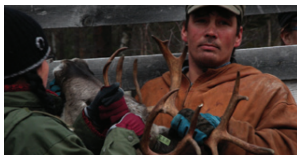
AATSINKI: THE STORY OF ARCTIC COWBOYS