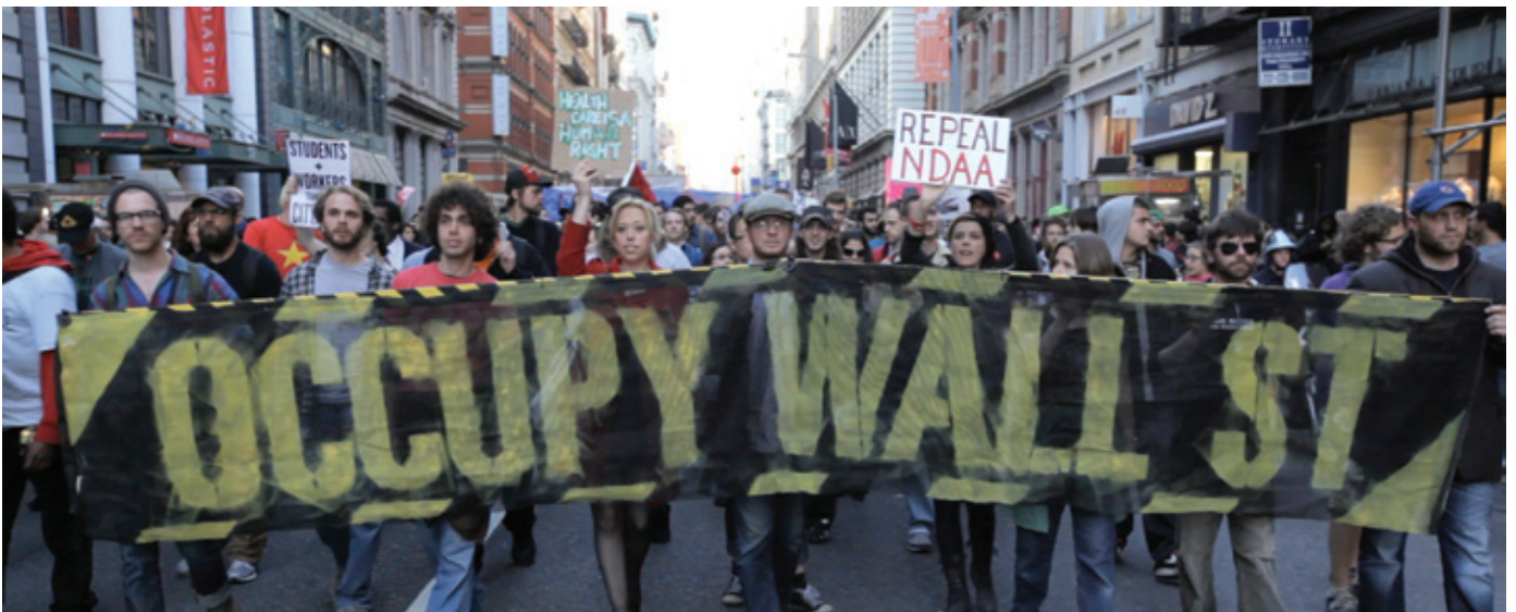
OCCUPY: THE MOVIE

SAT, APR 27 7:30 PM TBLB MON, APR 29 4:00 PM TBLB