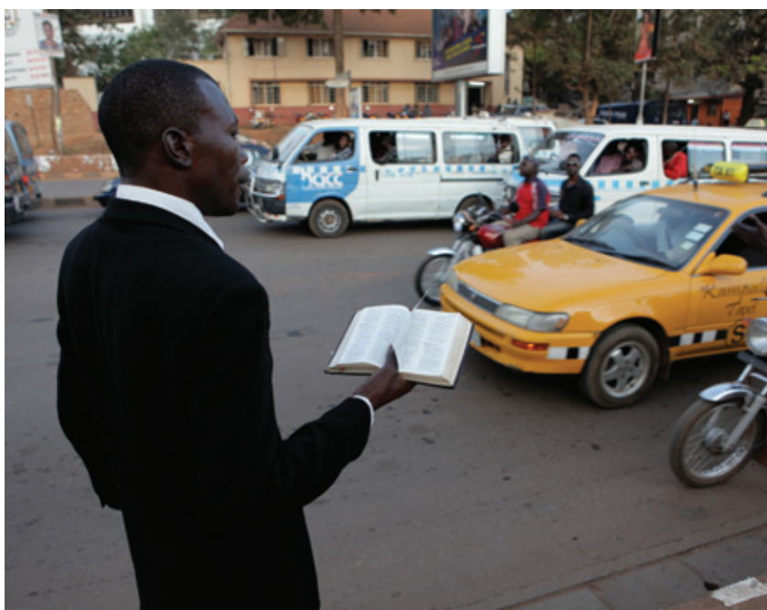
GOD LOVES UGANDA

THU, MAY 2 9:30 PM BLOOR FRI, MAY 3 4:15 PM SCOTIA SUN, MAY 5 4:15 PM BADER