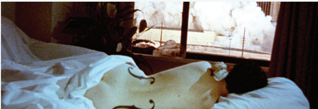
GAMBLING, GODS AND LSD