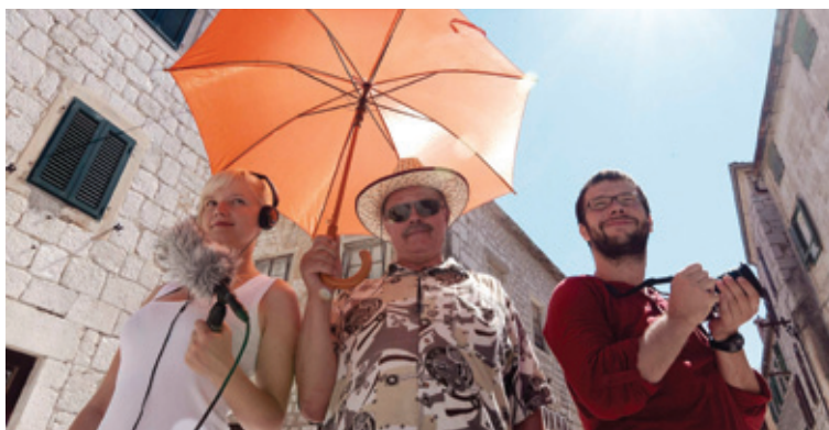
GANGSTER OF LOVE